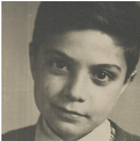
crop from tif – 371 KB