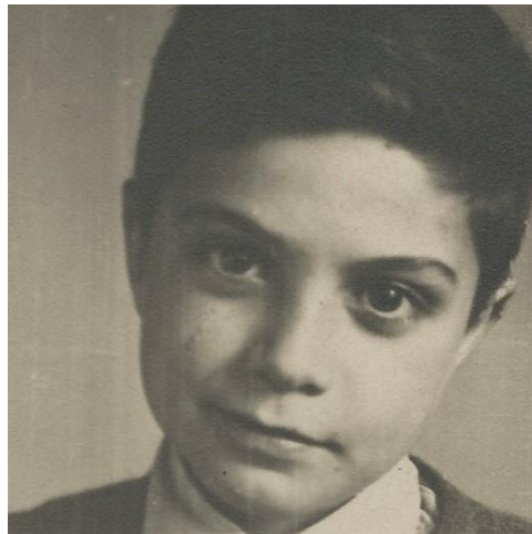
one crop from jpg – 74.2 KB