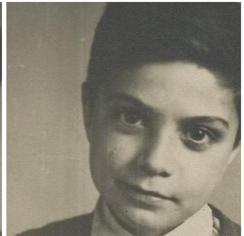
60 crops from jpg – 82.9 KB

Both jpg files are around the same size but the one cropped repeatedly looks a little muddy. If it's all you have, you keep it and love it. But, given a choice, we all want the better quality photo.