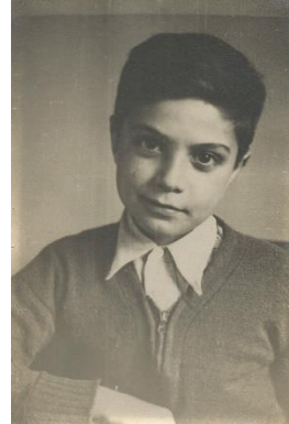
jpg – 188 KB