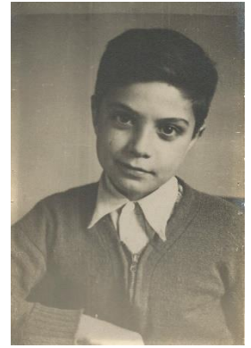
tif – 962 KB